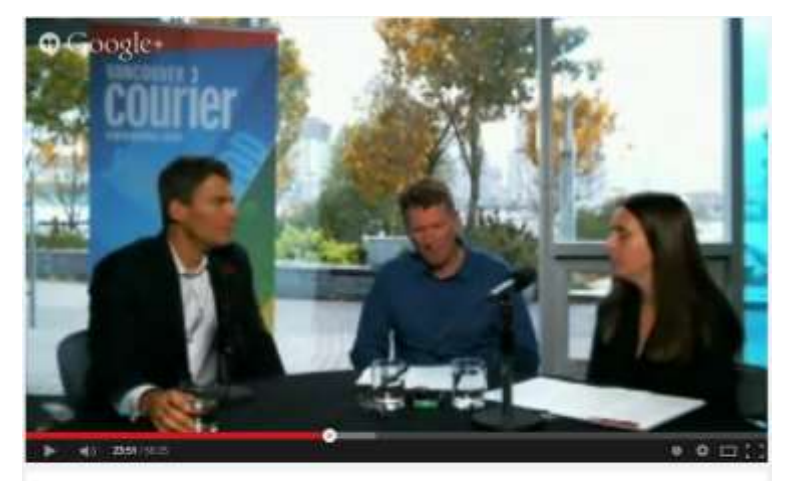
Live Streaming: Q&A with Mayor Gregor Robertson

Most recently, Vision refused to endorse a set of principles and goals for neighbourhood-based planning recommended by the Coalition of Vancouver Neighbourhoods CVN, a group of 25 residents associations and groups, In a recently televised interview with the Vancouver Courier, Mayor Robertson noted that the CVN proposal "doesn't align with the City's existing policy", a